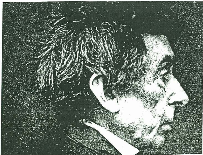
Chief Justice Roger Brooke Taney (1777 - 1864)

There is no better example how the phrase of William Shakespeare, " The First thing we do is kill all the lawyers, " comes into focus when one looks at how a nation that is governed by legal thinking can get so lost in its thoughts, we are incapable of moving forward. The man pictured above is the notorious Chief Justice Roger Brooke Taney who led the Supreme Court into instigating the Civil War when it delivered one of its most destructive decisions in history that illustrates how there truly is no rule of law in America, for we have allowed the blending of Subjective Thinking and Legal Thinking that has been undermining America and will destroy it completely. It was Taney who wrote the notorious decision Scott v Sanford where Dred Scott, a black slave, was taken to a state by his master where there was no legal slavery. He sued for his freedom, and lost. Taney wrote claiming that every black free or slave, was forever to remain a degraded life form within civilized society and could just never rise to a level worthy of American citizenship. This legal reasoning, he argued, was " too plain to be mistaken. " He argued that a century before the Declaration of Independence , he claimed blacks had " been regarded as beings of an inferior order, and altogether unfit to associate with the white race, either in social or political relations and so far inferior, that they had no rights which the white man was bound to respect. "